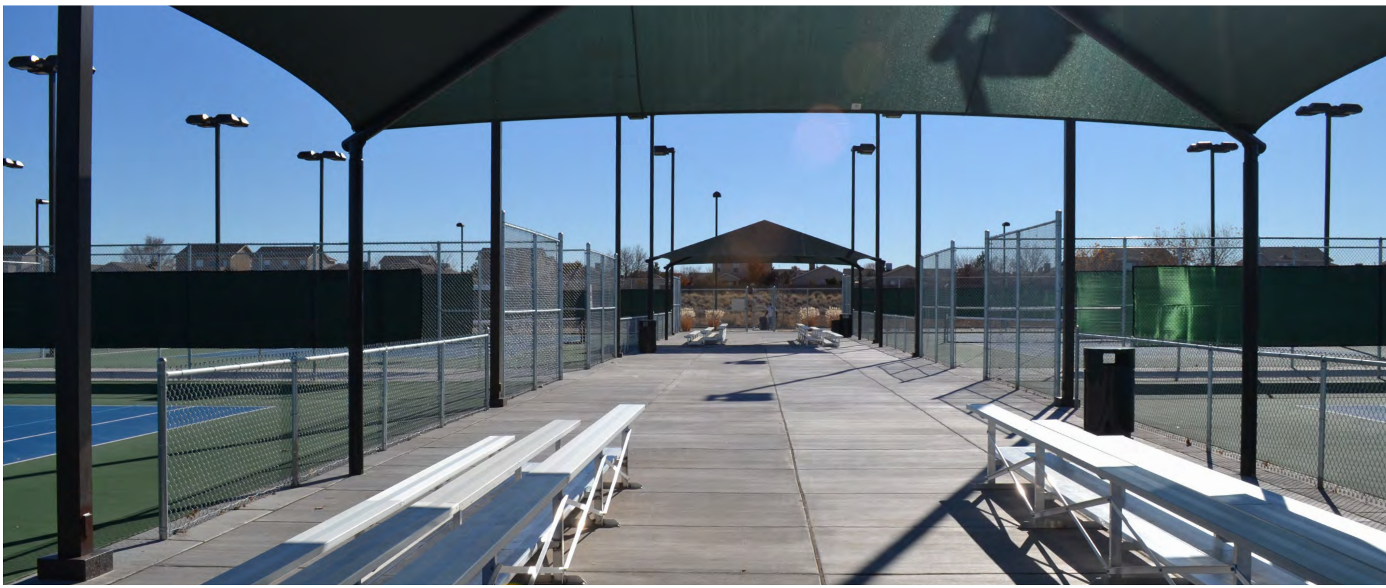
BLEACHERS FOR SPECTATORS