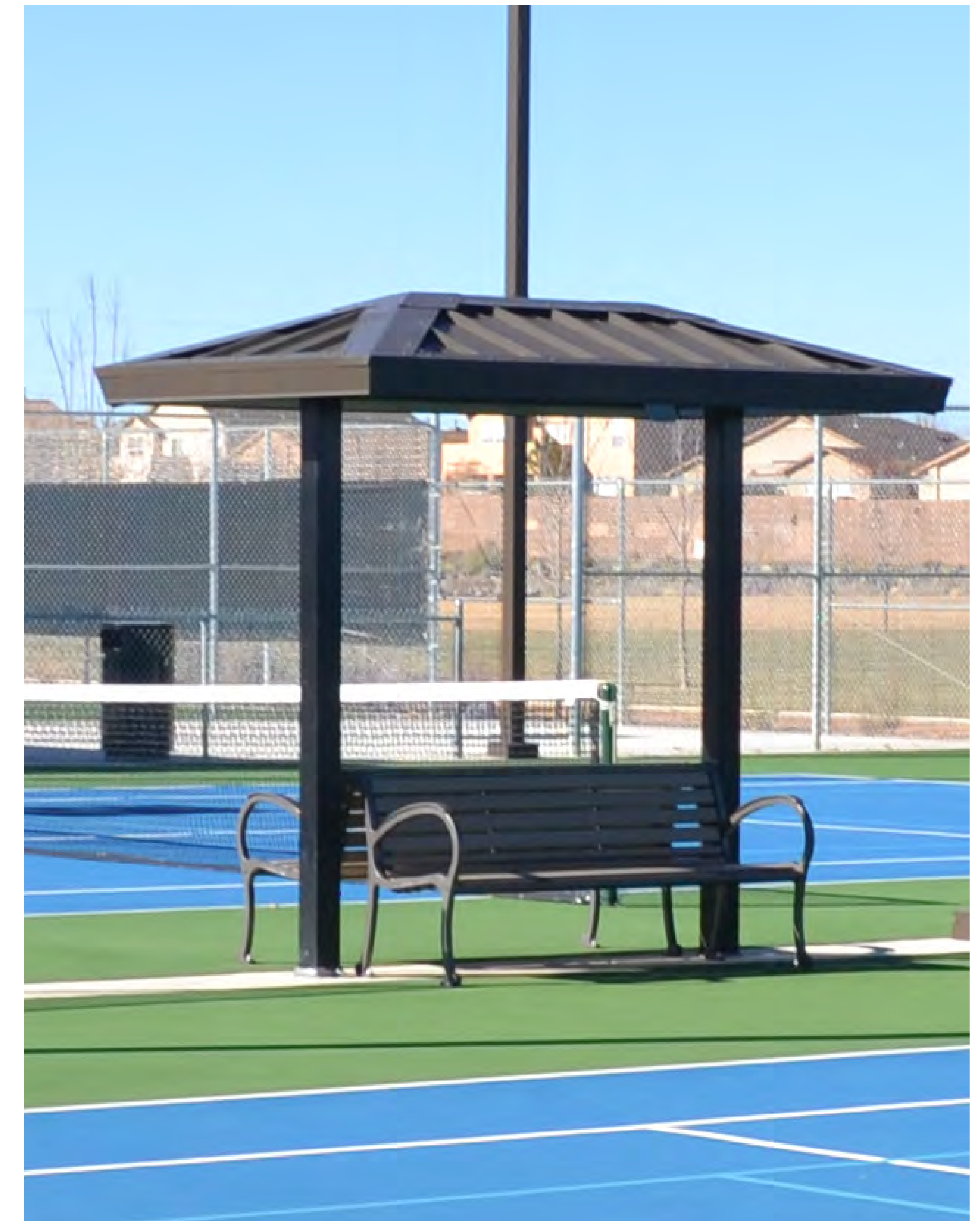
BENCH AND SHADE FOR PLAYERS