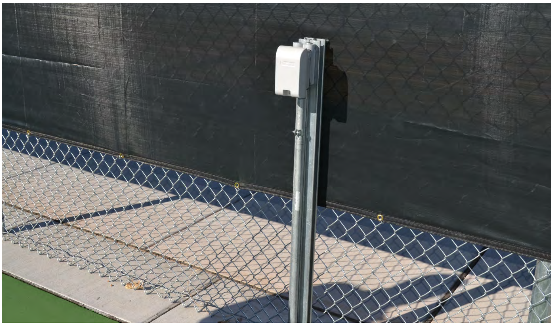
OUTLET FOR PICKLE BALL MACHINE