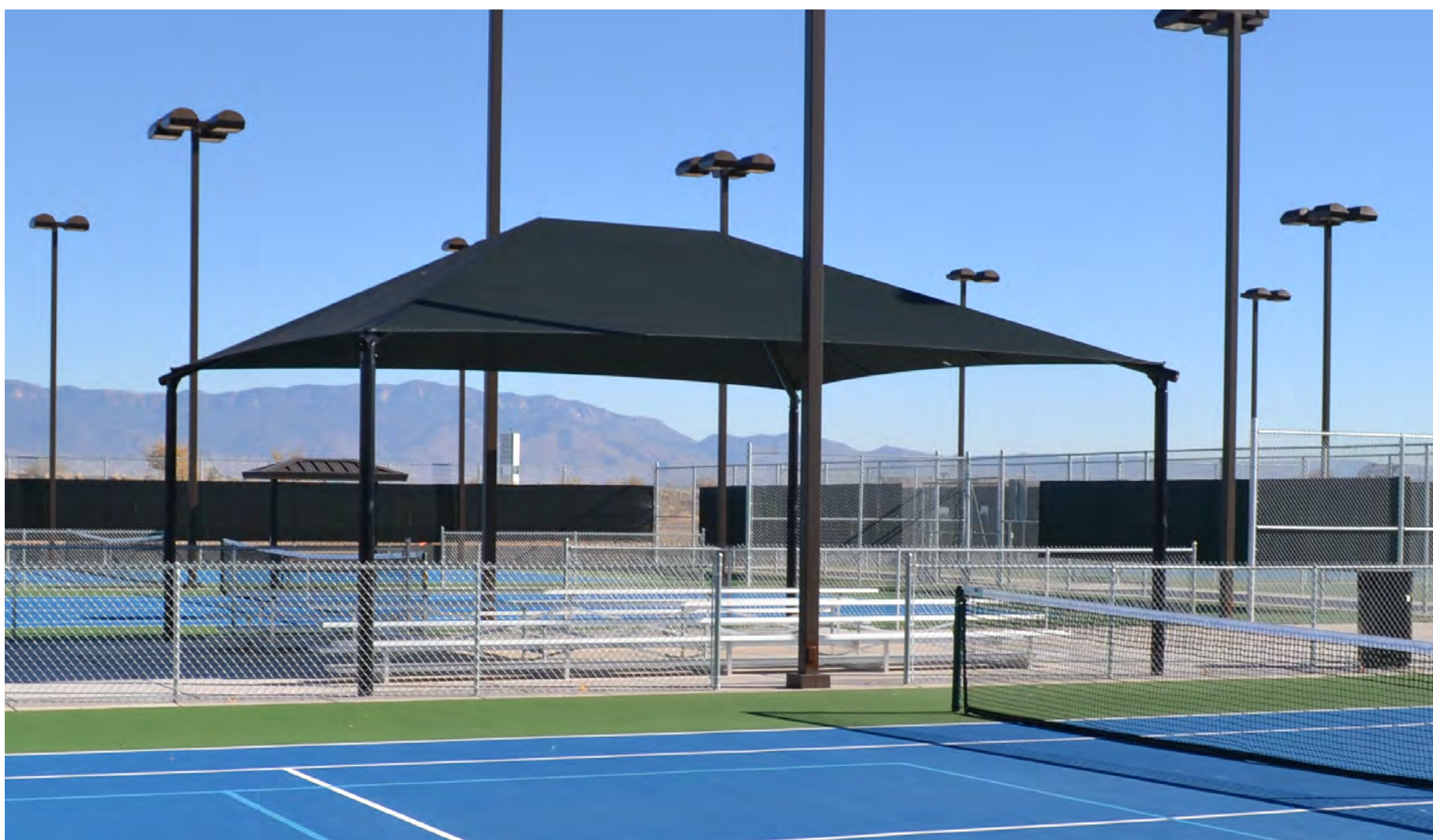
SHADE STRUCTURE OVER BLEACHERS